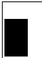
Half Page Island 4.75" x 7.5"