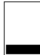
Quarter Page Horizontal 7" x 2.375"