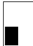
Quarter Page Vertical 3.5" x 4.375"