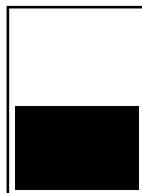
Half Page Horizontal 7" x 4.75"