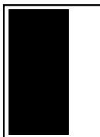
Two-Thirds Page Vertical 7.75" x 10"