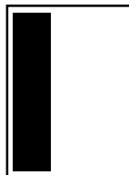
Third Page Vertical 2.375" x 10"