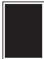
Full Page 7" x 10"

The APWA Reporter Advertising Sales Department American Public Works Association 2345 Grand Blvd., Suite 700 Kansas City, MO 64108-2625