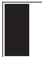
Two-Thirds Page Vertical 7.75" x 10"