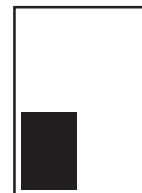
Quarter Page Vertical 3.5" x 4.375"