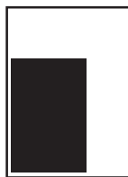
Half Page Island 4.25" x 7.25"