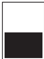
Half Page Horizontal 7" x 4.75"