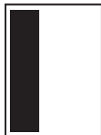
Third Page Vertical 2.375" x 10"