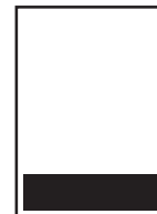
Quarter Page Horizontal 7" x 2.375"