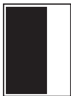
Two-Thirds Page Vertical 4.25" x 10"