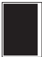
Full Page Live Area (no bleed) 7.25" x 10"