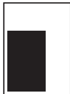
Half Page Island 4.75" x 7.5"