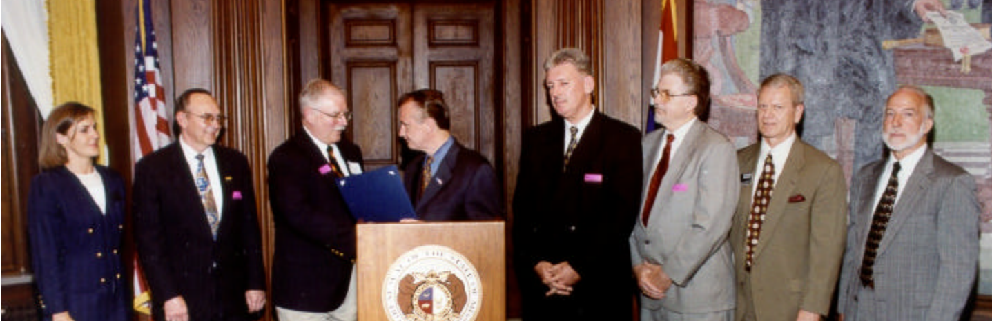
Missouri Governor Bob Holden signs a National Public Works Week Proclamation in front of Missouri and Kansas City Metro Chapter APWA representatives.