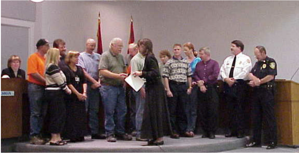
The City of Raytown Mayor & Board of Aldermen Proclamation given to the Public Works Department, EMS, Police & Fire Departments on May 21, 2002