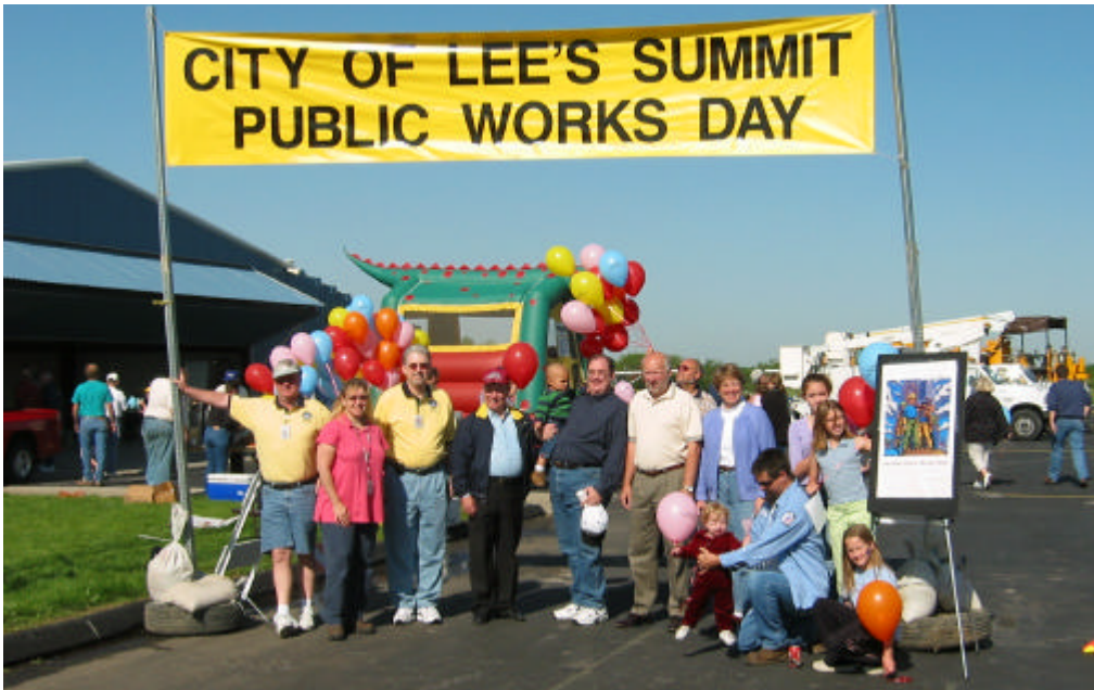
The City of Lee's Summit Celebrated NPWW May 18, 2002 at the Lee's Summit Municipal Airport